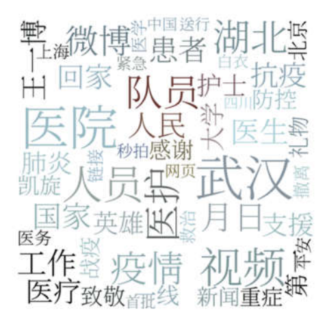
Figure 1. Word Cloud of the Top 50 Popular Words in the Main Dataset (N = 199,110)

Table 1 provides proportions, labels, and keywords of the 13 topics ranked by the size of the topic in a descending order. Topics discussing health workers in a non-gendered lens tended to emphasize their professional role. For example, topic 1 was the largest group of posts among the 13 topics and took up 17.3% tokens. Typical posts in topic 1 discussed the "professionalism" of health workers. Besides topic 1, topics of this type also included topic 2 ("triumphant return"), topic 3 ("homecoming gourmet"), topic 5 ("ICU stories"), and topic 13 ("news coverage"). These five topics jointly comprised 53.6% of all tokens, and they often unanimously referred to the aiding-hubei teams as collective groups instead of individuals, stressing the professional